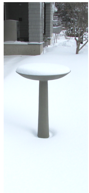
A snow filled bird bath awaits spring!