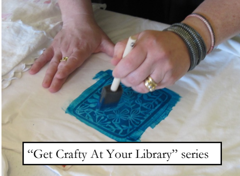
"Get Crafty At Your Library" series