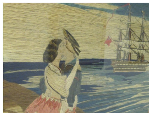
Detail of a woolie from the library's collection