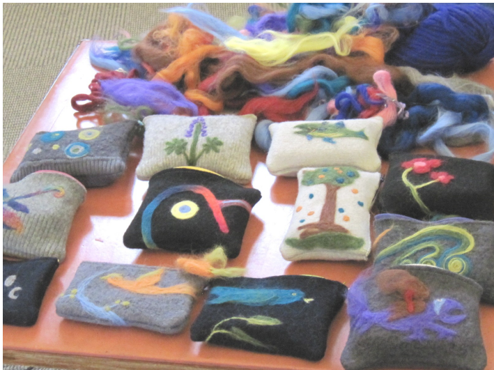
Needle felting workshop projects