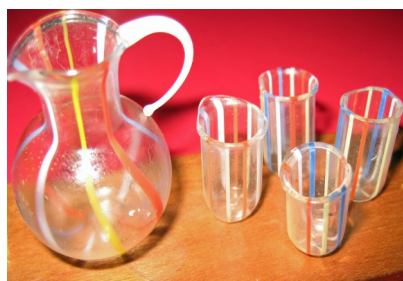
Miniature glass pitchers

An exhibit of little : not big: small in size: pleasingly small: compact: petite: slight: diminutive: half-pint: pocket-size: pygmy: small: bitty: dinky: mini: miniature: minimized: minute: puny: teeny-weeny: