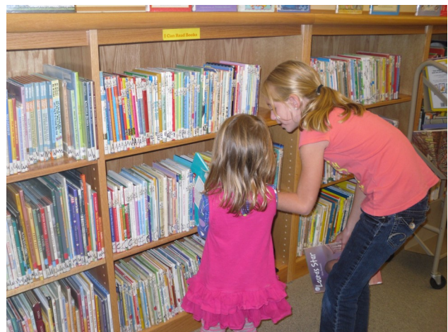
Young patrons enjoying the library

“I first came to know the Library through my parents, both of whom volunteered there in various capacities for almost 20 years. I am impressed by the friendly staff, by their efforts to help each one of us with our different needs and by the close connection between the library and the school. I also admire the effort to provide the public with access to computers and to the internet, which today are so critical to education. And last but not least, I think that the programs that the library organizes for the entire community, in summer and winter, are terrific.”