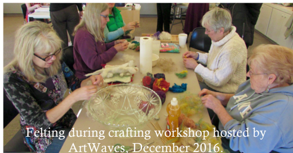
Felting during crafting workshop hosted by ArtWaves, December 2016.