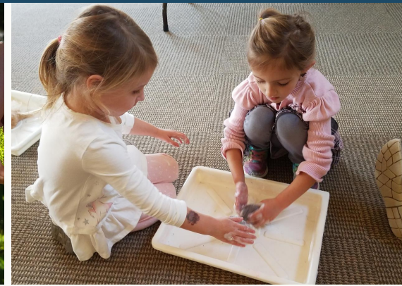
Making felt geodes

WHAT'S HAPPENING IN THE CHILDREN'S ROOM As our summer programs came to a close, we were happy to welcome back MDES students for their regular library visits. With each class visit we are flooded with 15- 20 students eager for new books! After school, in addition to Lego Time Tuesday, we are a cozy gathering spot for kids to do homework, use computers, play board games, and, of course, read.