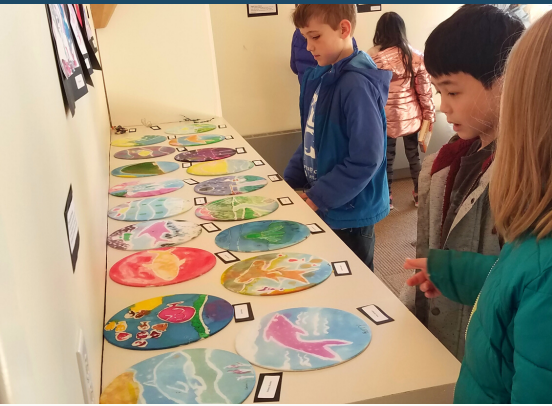
Students visiting the January art show