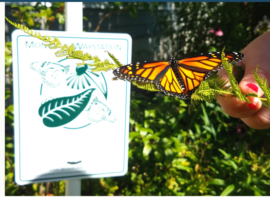
A monarch beside our new official waystation sign