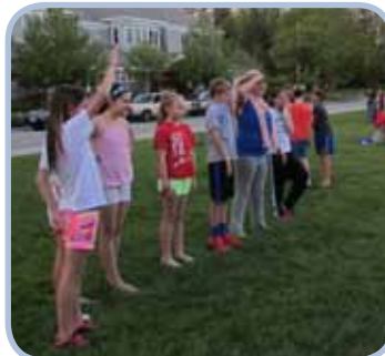
6th graders morning activity, Library Sleepover