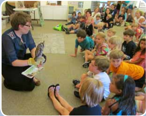
Chewonki Owls of Maine